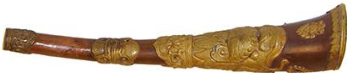
Tibetan trumpet from the Horniman Museum & Gardens collection

Many of the featured collections have not been easily accessible to the public before, having been hidden in local collections and remote locations, unseen in storage or not previously documented online. The MINIM-UK cataloguers travelled over 10,000 miles in 200 days to collect photographs, video and sound recordings and stories spanning from the Scottish Highlands to the South coast.