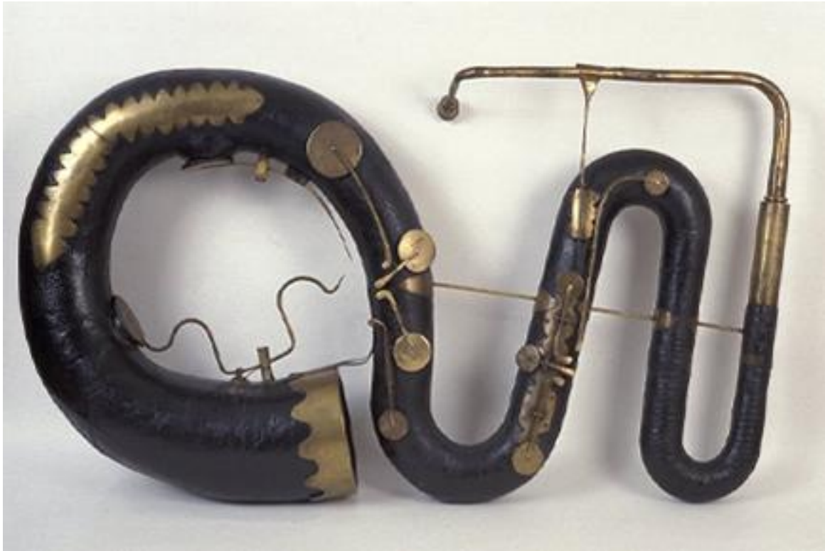
Contrabass serpent from the University of Edinburgh musical instrument collection

Many of the featured collections have not been easily accessible to the public before, having been hidden in local collections and remote locations, unseen in storage or not previously documented online. The MINIM-UK cataloguers travelled over 10,000 miles in 200 days to collect photographs, video and sound recordings and stories spanning from the Scottish Highlands to the South coast.