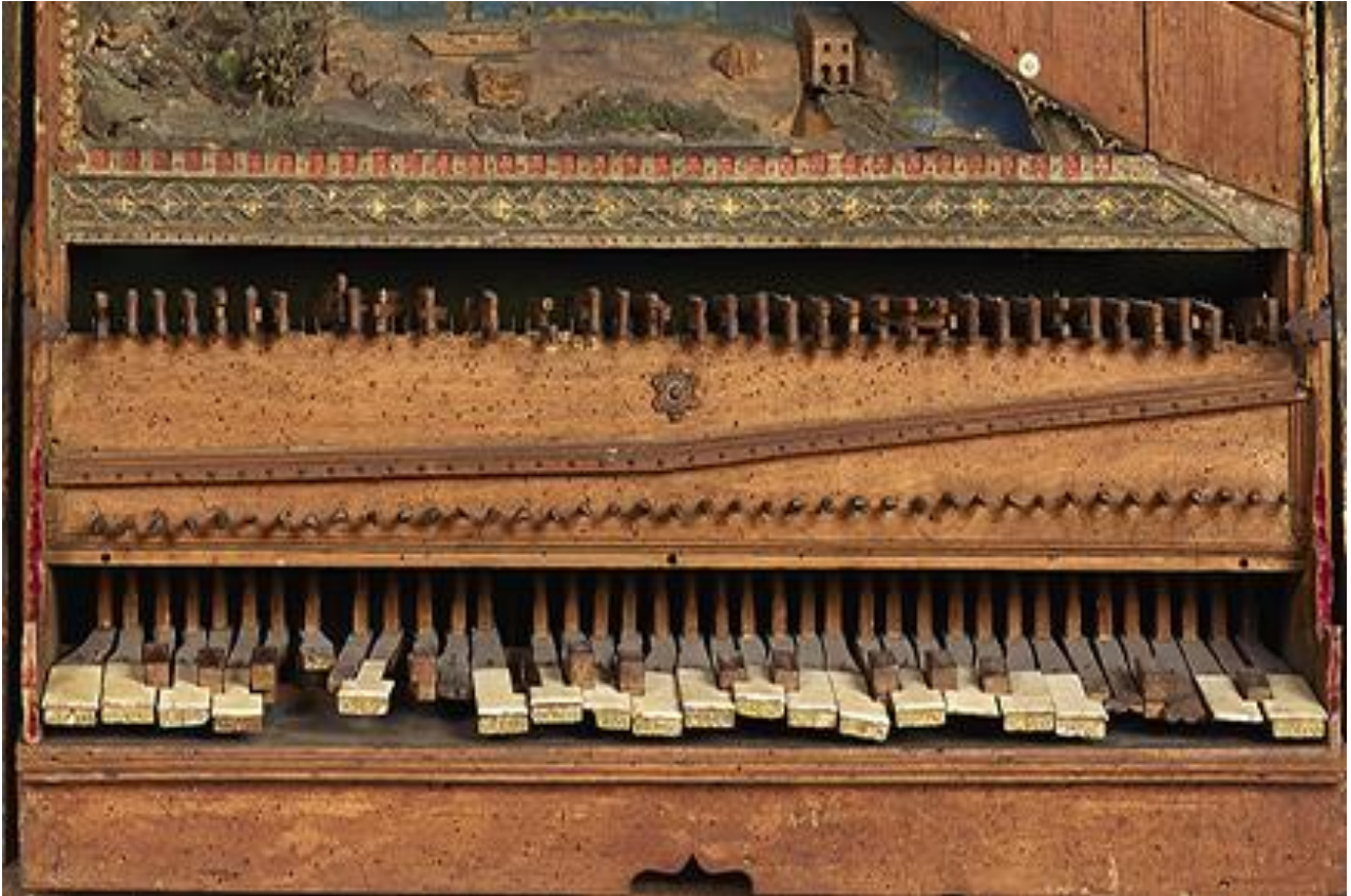
Clavicytherium from the Royal College of Music Museum collection

The Royal College of Music is proud to bring together 5,000 years of musical heritage from 200 UK collections in a major new website documenting 20,000 historically significant musical instruments.